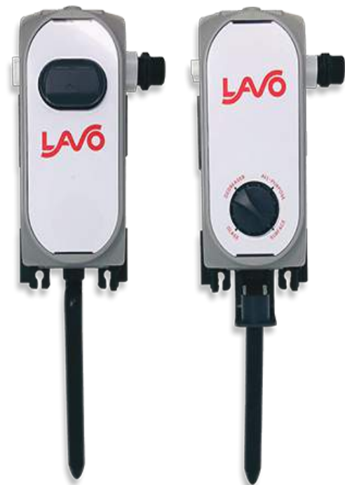
1 Product Push-Button Unit

LavoDose features Flex Gap and Air Gap options which meet ASSE 1055 standards.