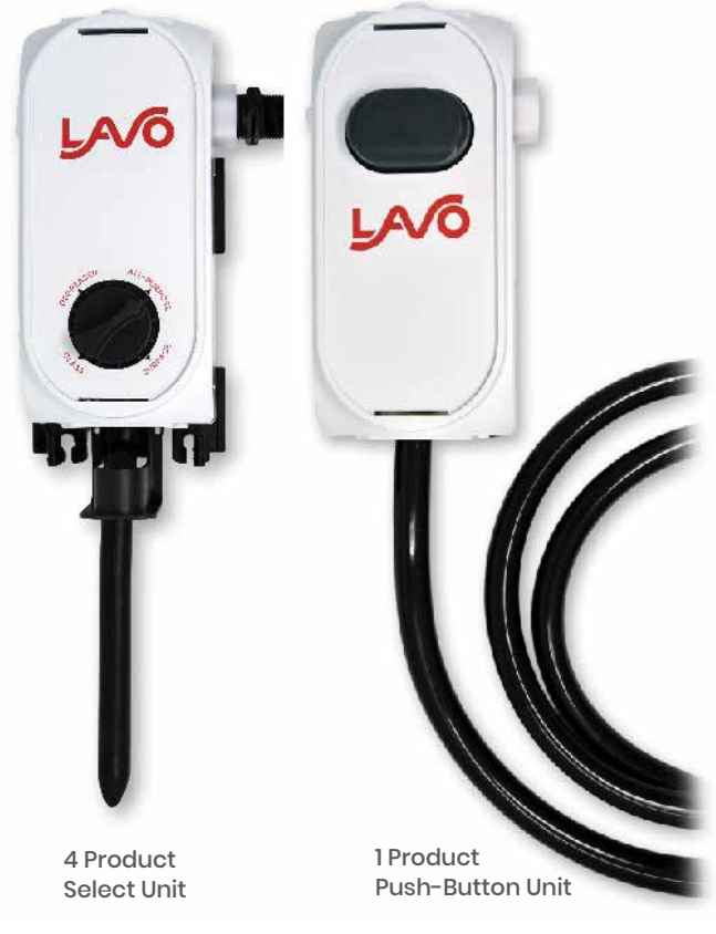
Popular Dual Select Configuration

LavoDose features Flex Gap and Air Gap options which meet ASSE 1055 standards.