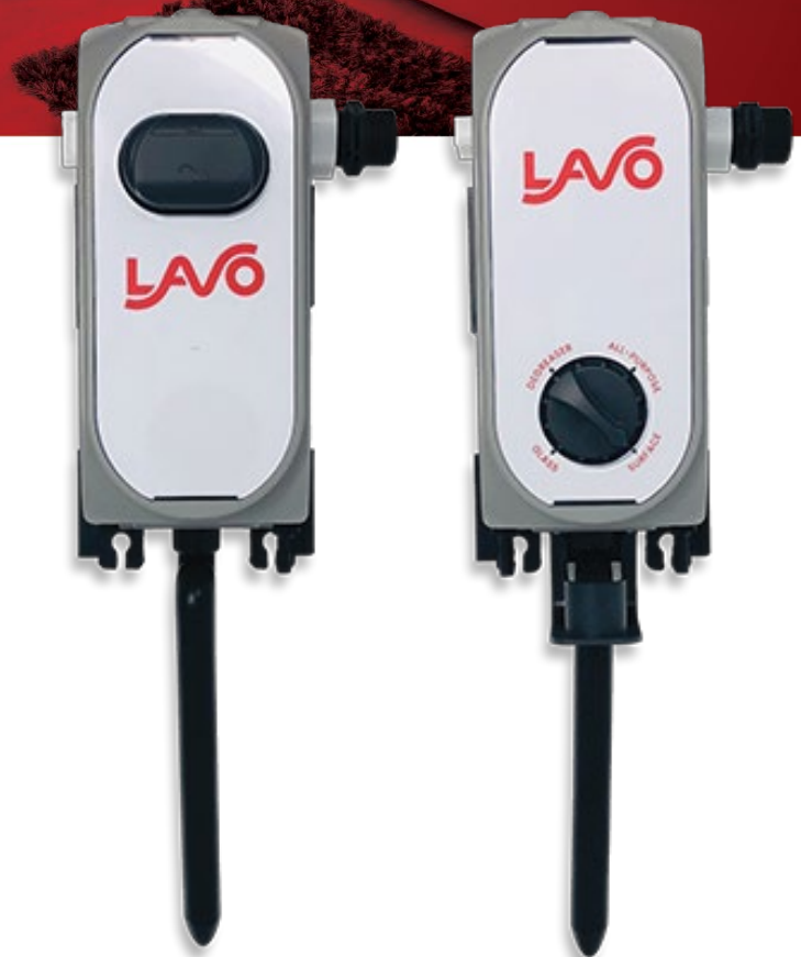
4 Product Select Unit

LavoDose features Flex Gap and Air Gap options which meet ASSE 1055 standards.