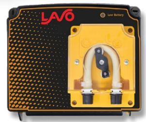
DrainPro with Battery