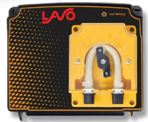
DrainPro with Battery