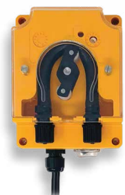
LavoWare Detergent (Probe/Problems Liquid / Dry)