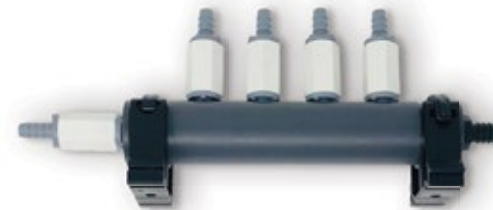
Flush Manifold, 4-product