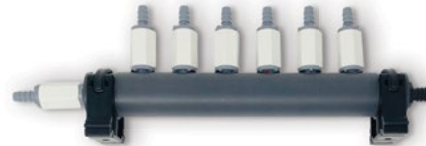
Flush Manifold, 6-product